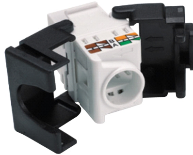
C. Rear view of Keystone with wire cap attached